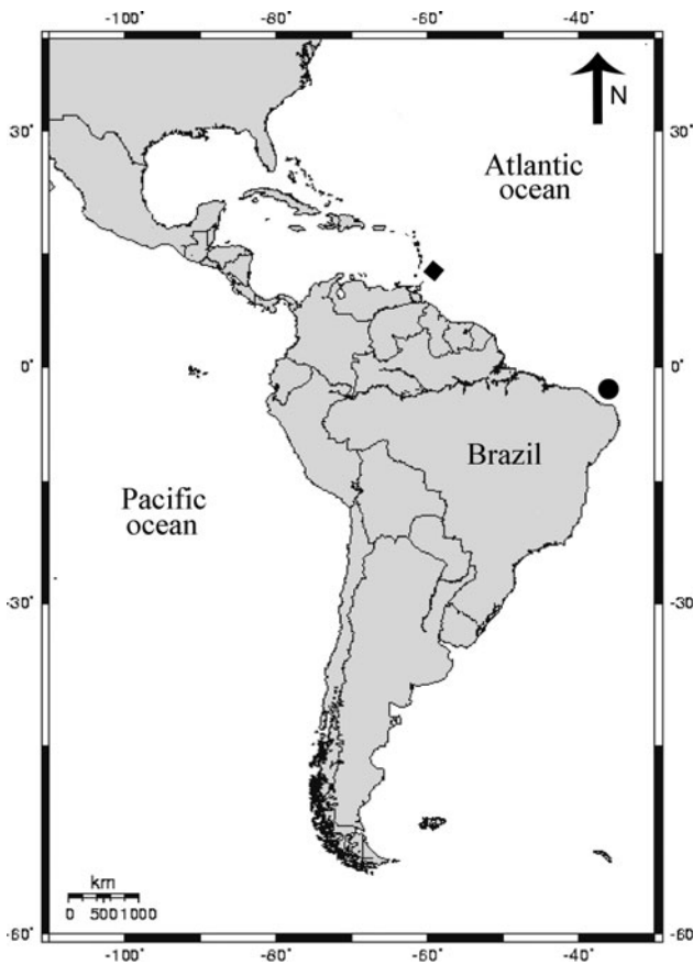
Fig. 2. Distribution of Eurysquilla petronioi sp. nov., in the western Atlantic: holotype (◆) and paratype (●).

Eurysquilla petronioi sp. nov. is the fifth western Atlantic species of the genus and the second from Brazilian waters, alongside E. plumata . A key to the species of the genus is given below.