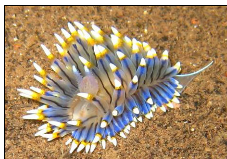
Fig. 3. Janolus n. sp. (photo P. Wirtz).