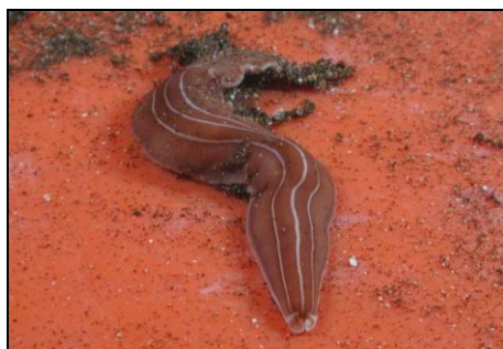
Fig. 1. The nemertine Drepanogigas albolineatus

al. 2002). When I searched for it on the same species of black coral, in 35 m depth near Machico, south coast of Madeira, I immediately found it. It is, in fact, quite common at this site.