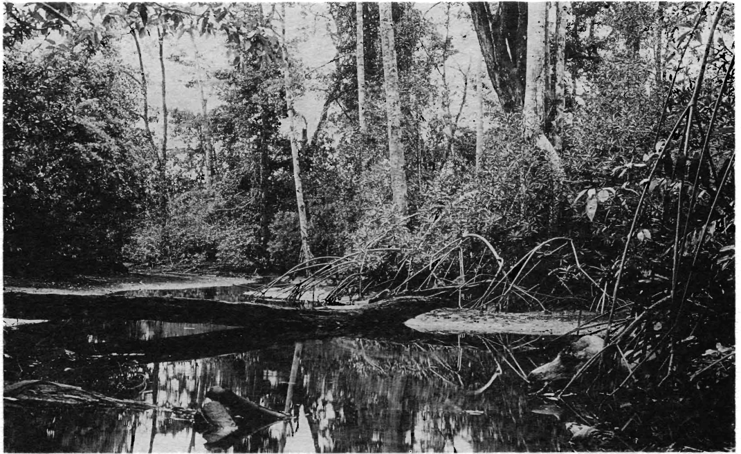
1. "Askoy" Station 103. Río Changamé, a short distance above its mouth on the Ensenada de Coredó (Humboldt Bay), Colombia. The burrows of fiddler crabs may be seen on the far bank. Uca schmitti and U. latimanus were taken at this station