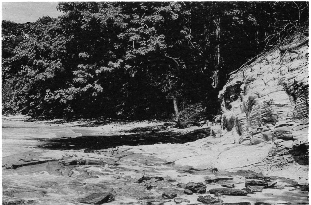
2. "Askoy" Station 110. Northwest corner of Contadora Island, Perlas Islands, Panama. Uca panamensis is found under stones at the ends of such beaches