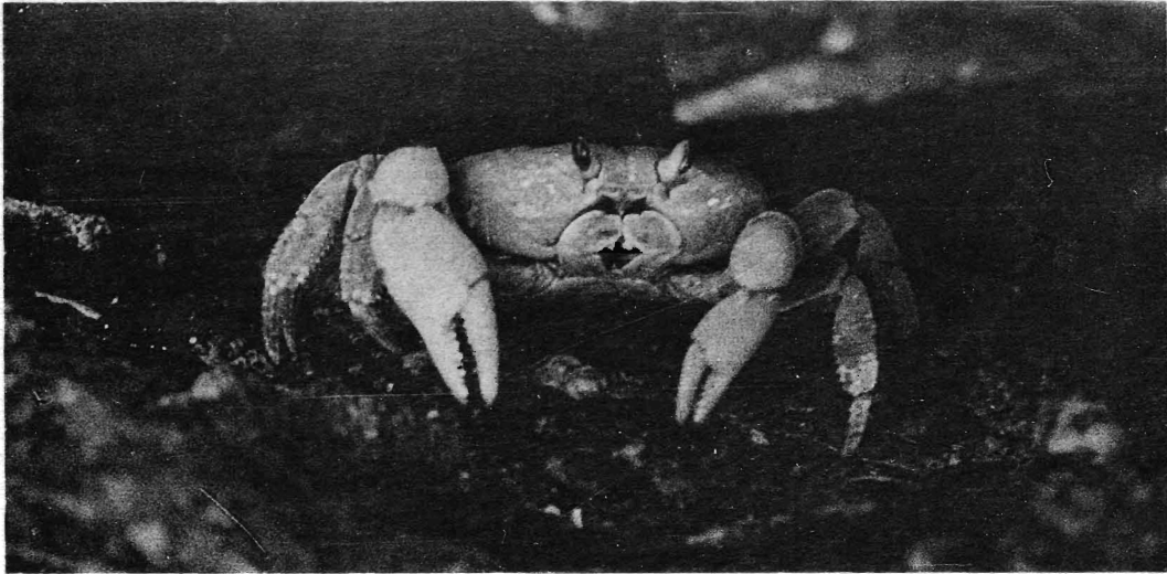
1. "Askoy" Station 55. At Malpelo Island, Colombia, land crabs of ghoulish appearance and with shells of ghostly white eye the visitor with uncomfortable intent