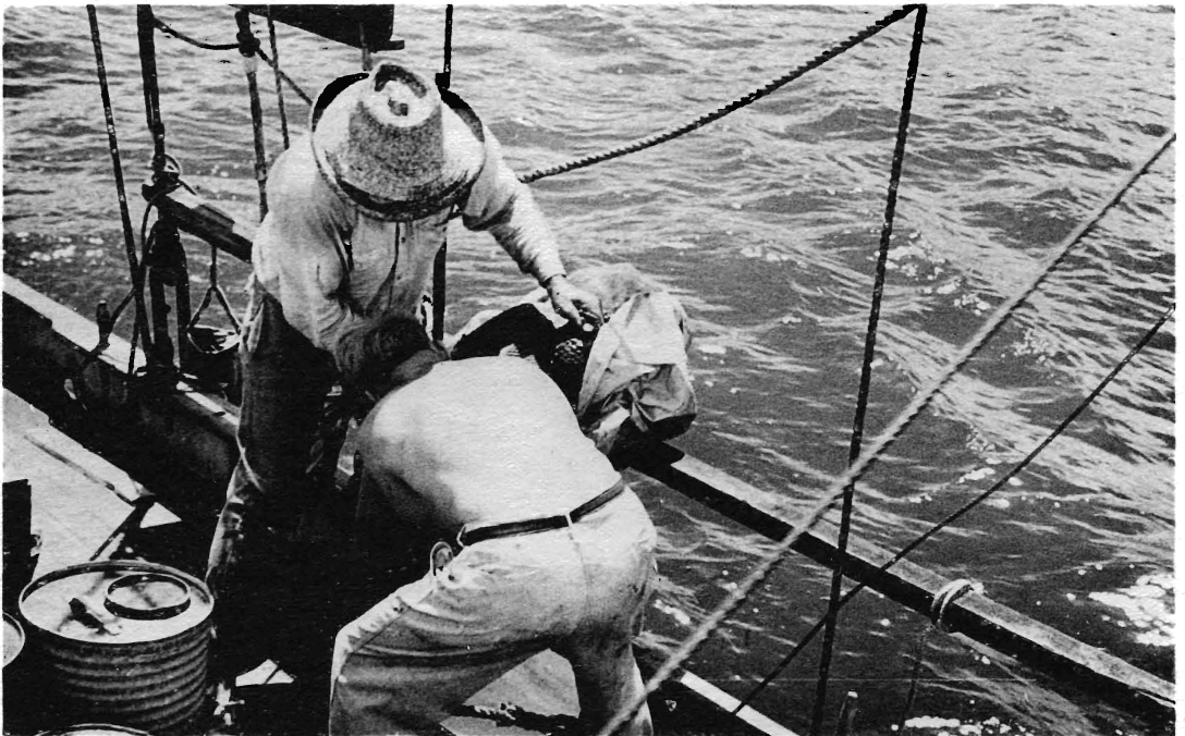
2. Scientists emptying small dredge at Cueva Bay, Colombia, "Askoy" Station 93. A canvas skirt is sometimes used to prevent the fine mesh from tearing on sharp submarine projections