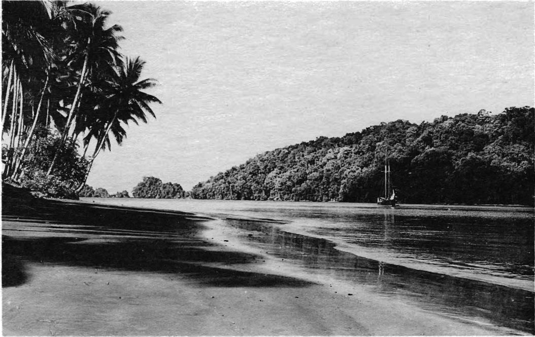
1. "Askoy" Station 100. Puerto Utria, Colombia, looking southward towards the entrance of the bay, with the "Askoy" at anchor