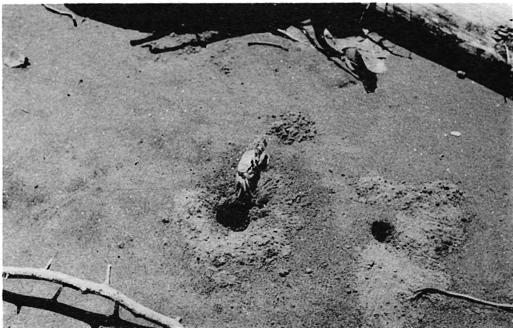
1. Ghost crab, Ocypode gaudichaudii , at entrance to its burrow, Puerto Utria, Colombia (see text)