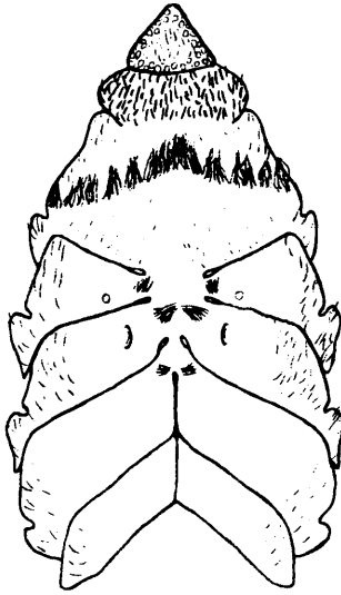
FIG. 2. Krunopeltarion timorensis gen. nov., sp. nov. Sternal plastron.

gastric furrows ("fossettes gastriques"), one oblique pair behind cardiac region, pair of very short oblique furrows on anterior part of metagastric region, and pair of short oblique furrows anterolateral of metagastric region. Long, distinct transverse furrow posterior to frontal region. Ventrally, sub-hepatic and sub-branchial regions densely covered with blunt tubercles and sparse setae. Pterygostomial region smooth, only anterolaterally covered with very small blunt tubercles.