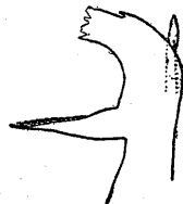
FIG. 1. Discias serrifer , mandible, much enlarged.

This family is allied to the Atyidæ and the Oplophoridæ (= Acanthephyridæ). The Atyidæ inhabit fresh water; they have the first two pairs of pereiopods similar, with spoon-shaped fingers, and the mandible without a palp. In the Oplophoridæ the animal is dorsally carinated, the antennal scale is long and rigid, the first two pairs of pereiopods are long, slender and similar.