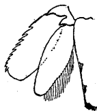
FIG. 4. Discias serrifer , tail fan ( \times 14 ).

The postero-inferior angles of the fifth and sixth segments of the abdomen are subacute; sixth segment about one and a third times as long as the fifth; the telson is one and three fifths times as long as the sixth segment and has two pairs of lateral spinules, the extremity is rounded and armed with about ten or twelve spinules; the uropods are scarcely longer than the telson, oval, the outer is the broader and along its outer margin is cut into from ten to twelve teeth, becoming gradually a little smaller and closer towards the posterior extremity.