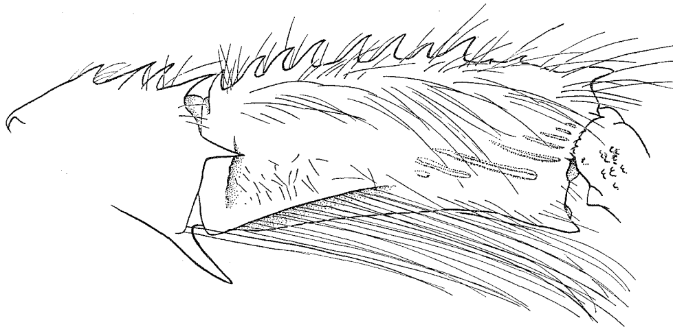
Fig. 1. Inner surface of palm of 1st pereopod in Upogebia spinifrons (HASWELL, 1882); AM P 12943, male, t.l. 15.5 mm.

Remarks :—Of three females of U. spinifrons from Port Stephens, DE MAN (1927) described two as U. spinifrons , though one as U. neglecta , and firstly noticed that the