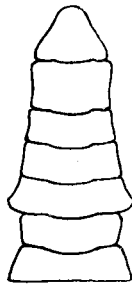
Fig. 3.—Abdomen of Acanthodes armatus , male.

Cancer (Acanthodes) armatus , de Haan, Fauna Japon. Crust., 1835, p. 52, pl. B (part), pl. iv. Doflein, Abh. k. bayer. Akad. Wiss., Cl. ii., xxi., 1902, p. 661, pl. ii.