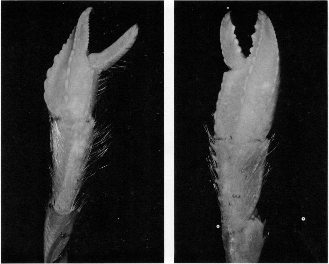
Fig. 2. Ceratopagurus tricarinatus (Stimpson, 1858), female, CAS 046661. Left, Left cheliped. Right, Right cheliped. 11× Magnification.

generally similar from left to right. Dactyls at least half again length of propodi; in dorsal view, slightly twisted; in lateral view, slightly curved ventrally; dorsal surfaces each with row of long stiff bristles becoming spiniform in distal half and accompanied by short corneous spines, increasing in size distally, lateral faces with row of very short setae, mesial faces each with row of corneous spinules dorsally, ventral margin proximally and ventromesial margin distally with row of corneous spines, increasing in size distally. Propodi 1\frac{1}{4} to twice length of carpi, dorsal margins each with short transverse rows of long setae, ventral margins tufts of setae and corneous spine at distal margin. Carpi \frac{1}{2} to \frac{2}{3} length of meri; dorsal surfaces each with spine at distal