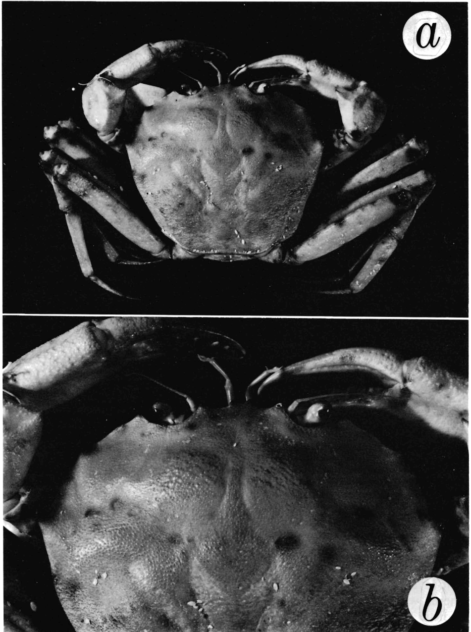
Fig. 2. Chaceon ramosae , male paratype, cl 107 mm, sta. 64 CB 105: a, Dorsal view; b, Carapace.

Remarks. — This species resembles C. quinquedens (Smith, 1879) in having depressed dactyli on the walking legs, but differs in numerous features: the carapace is much more granular posterolaterally, the suborbital tooth is less developed, the car-