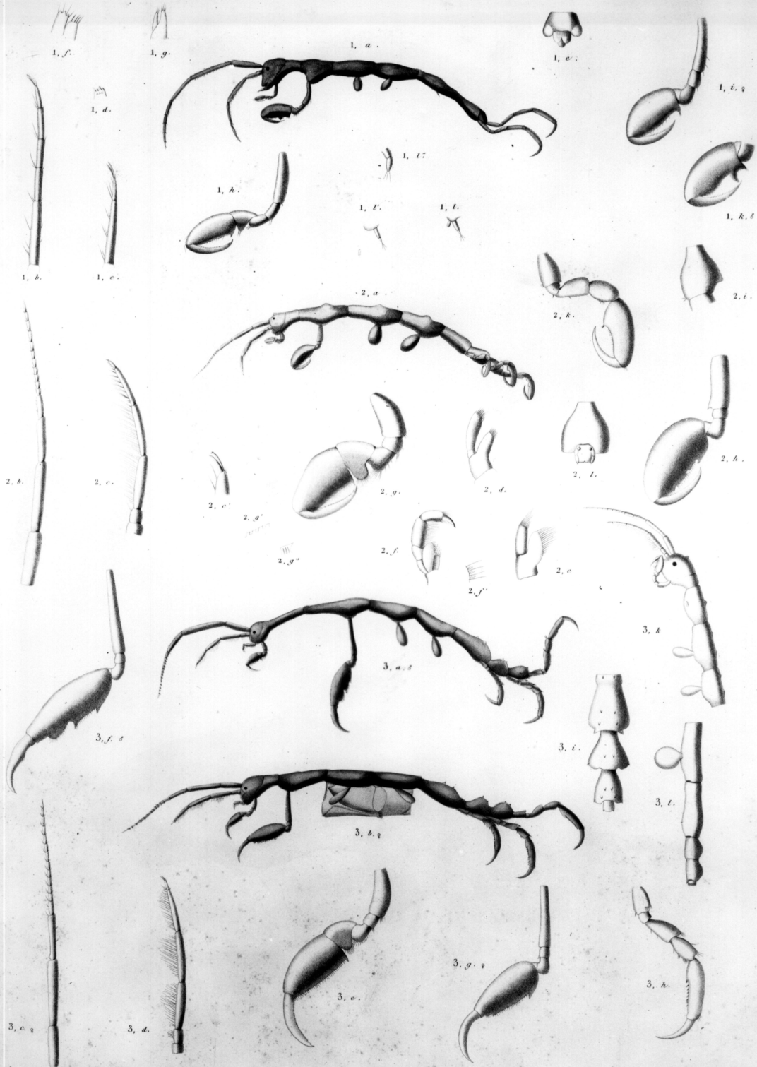
Fig. 1. a-l. PODALIRIUS TYPICUS. Kr.