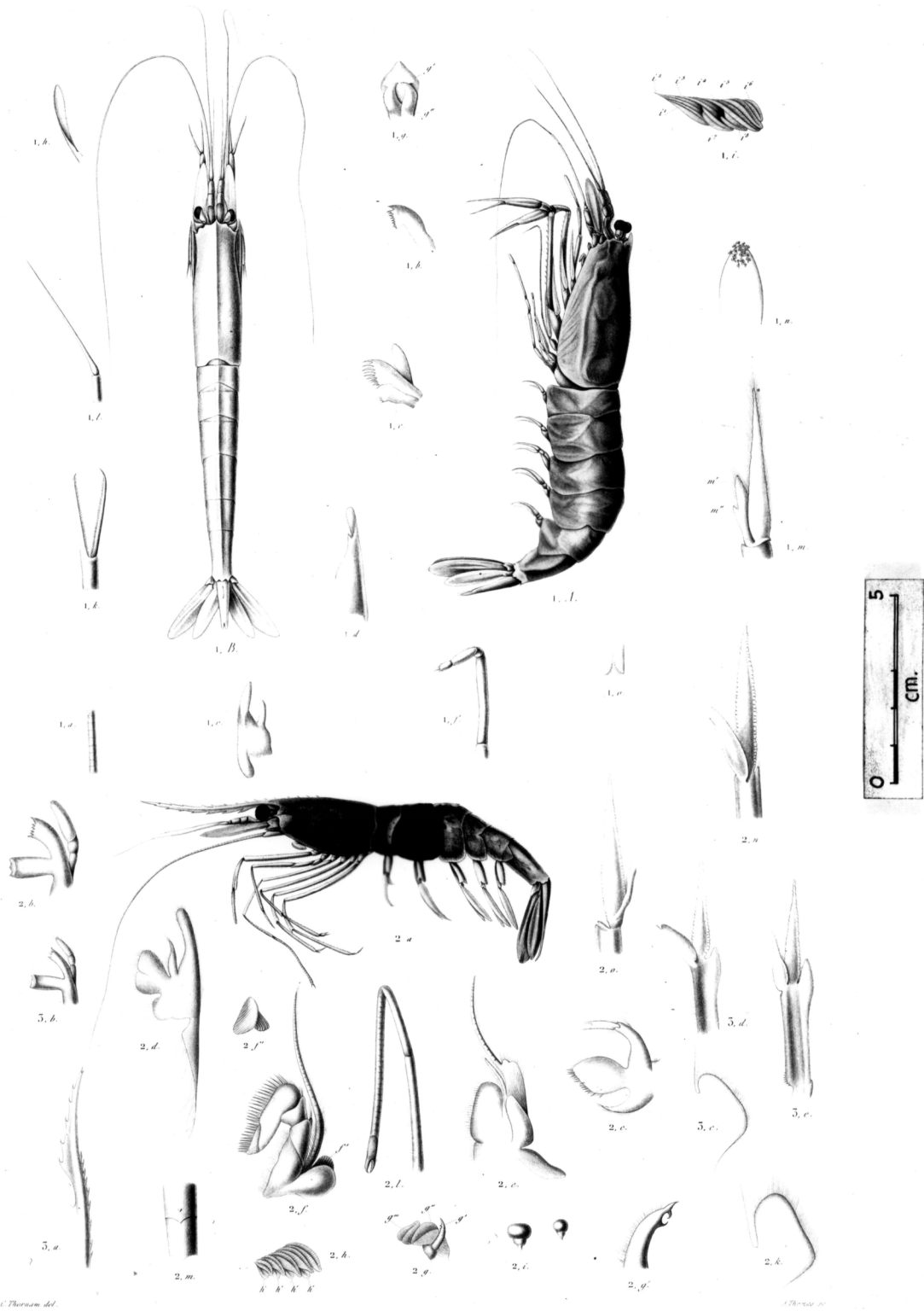
Fig. 1. A, B. PASIPHEEA TARDA , Krøyer. non sp.