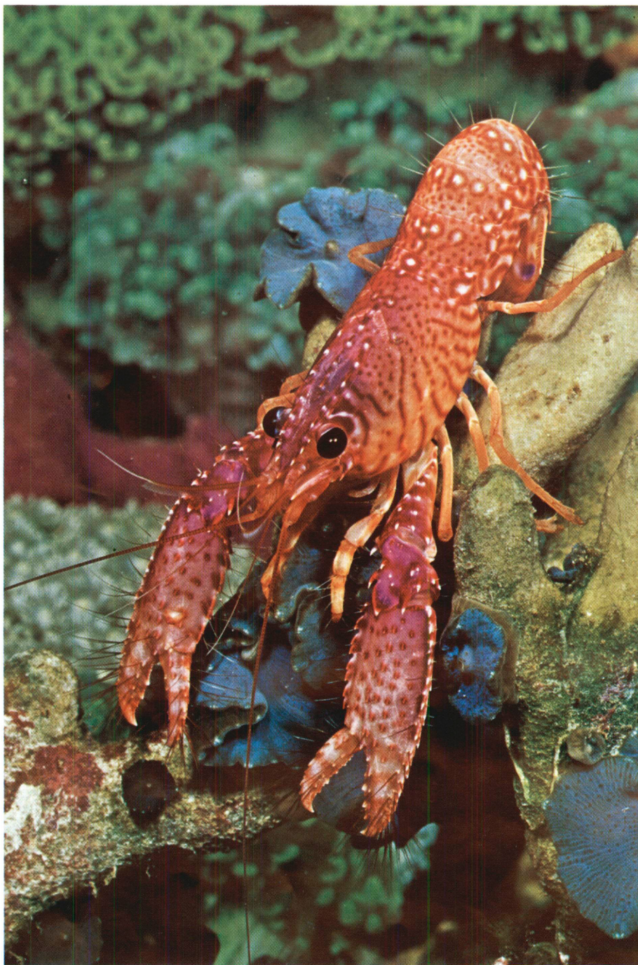
Enoplometopus daumi new species, oblique frontal view.