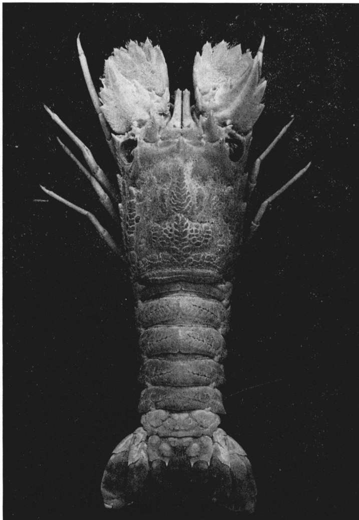
FIG. 1. — Scyllarus aurora new species, ♂ paratype, Tubuai Islands, MNHN Pa 566 ( \times 1,3 ).

Tubuai Island, Society Islands, 23°18' S 149°30' W ; depth 200 m ; leg. B. RICHER DE FORGES ; no. 7913403 ; 14 May 1979. — 1 ♂, cl. 30 mm.