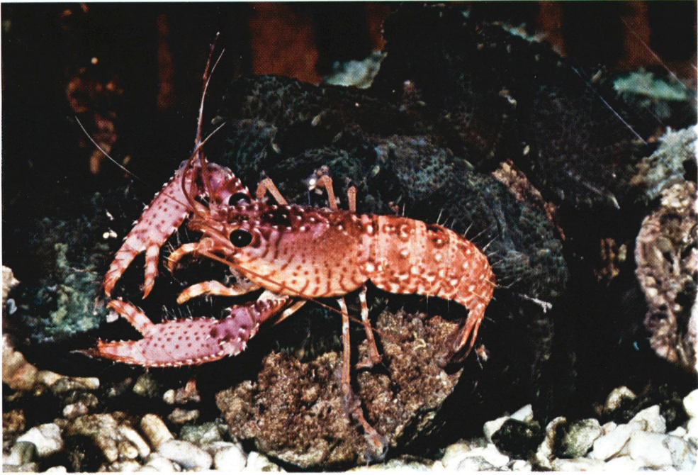
Enoplometopus daumi new species, oblique lateral view.