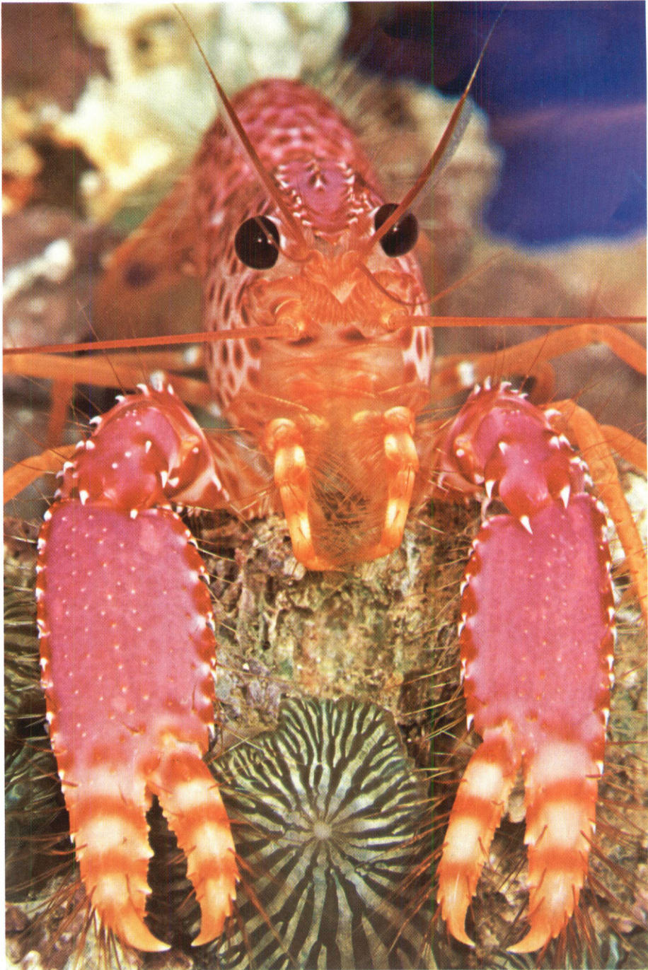
Enoplometopus debelius new species, frontal view.