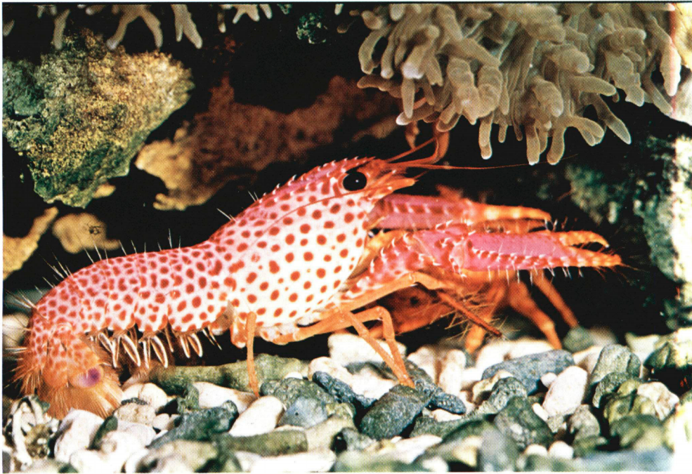
Enoplometopus debelius new species, lateral view.