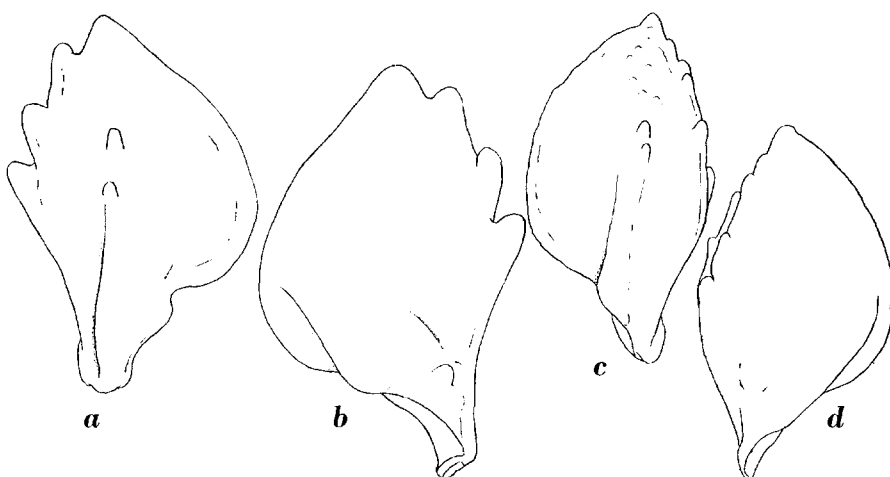
Fig. 1. a, b, Astacoidea m. madagascarensis (H. Milne Edwards & Audouin), paralectotype; c, d, Astacoidea m. caldwelli (Bate), lectotype of Astacoidea goudotii Guérin. a, c, scaphocerite in ventral view; b, d, scaphocerite in dorsal view. a-d, \times 7 .

In the collection of the Leiden Museum a syntype of Astacus madagascarensis H. Milne Edwards & Audouin is preserved. It was obtained in 1843 from the Paris Museum. A letter of 7 February 1843 from H. Milne Edwards to W. de Haan, which is present in the archives of the Leiden Museum, announced the dispatch of the collection. This letter may be cited here in full as it gives a good picture of the exchanges that in that time took place among various museums: