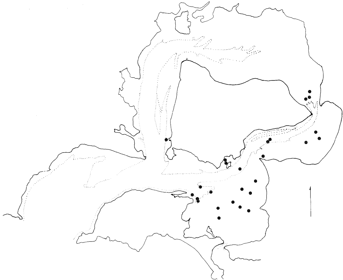
Fig. 4—Distribution of Callianassa limosa in Western Port. Dots indicate survey stations at which C. limosa was found, dotted line the 5.5 m depth contour.

poorly sorted coarser sediments, sometimes bound by plants ( Caulerpa spp.). In Port Phillip Bay Callianassa australiensis is uncommon.