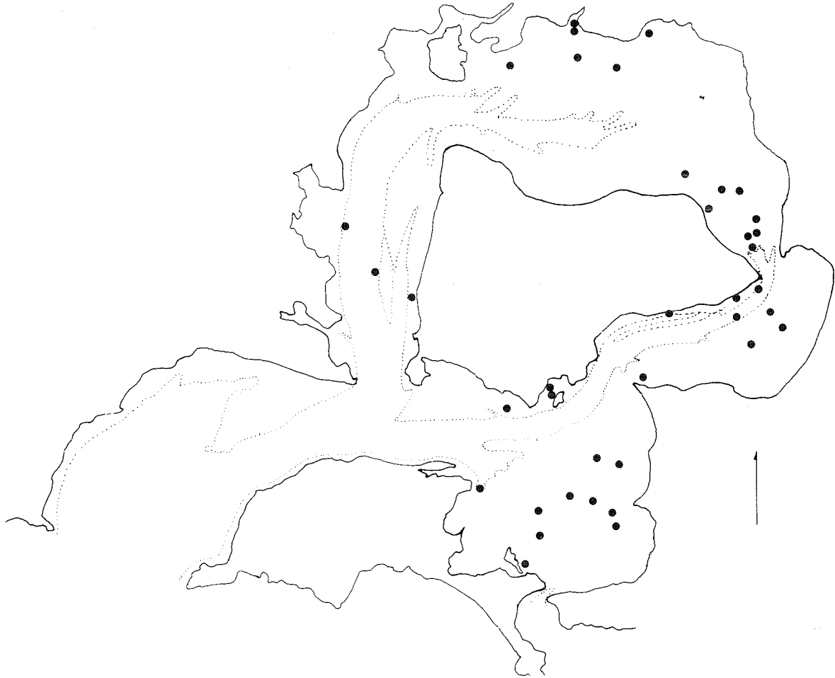
Fig. 2—Distribution of Callianassa arenosa in Western Port. Dots indicate survey stations at which C. arenosa was found. The dotted line indicates the 5.5 m depth contour.

tions, being found only in sand (Table 1). Its distribution was patchy but it was most abundant in North Arm; no specimens were collected from the Tooradin tidal flats or from the East Arm Embayment Plain. C. australiensis preferred shallower areas (Table 1) and was most abundant between 3 and 10 m. In general,