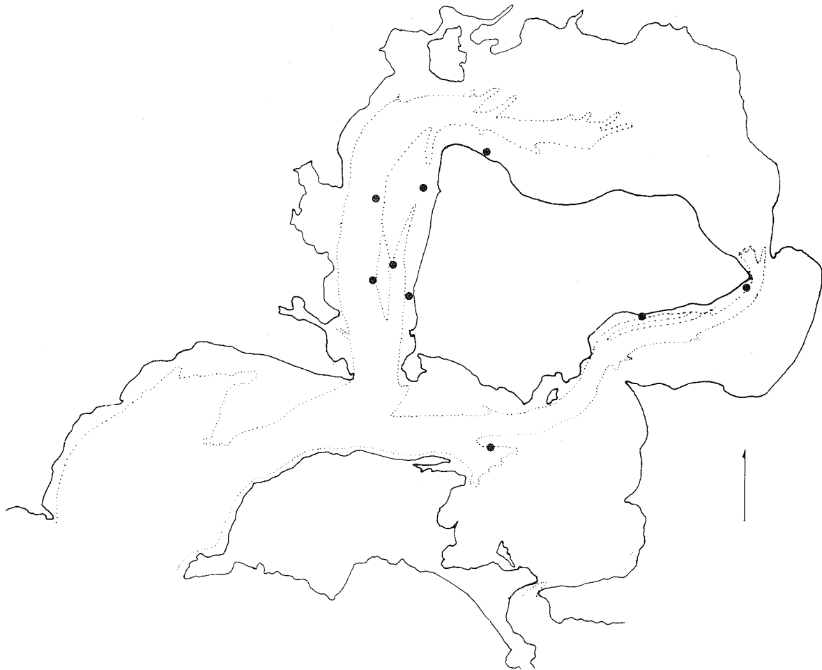
Fig. 3—Distribution of Callianassa australiensis in Western Port. Dots indicate survey stations at which C. australiensis was found. The dotted line indicates the 5.5 m depth contour.

and sediment mobility make this environment too unstable. Harder to understand was the absence of Callianassa from a large area in the north-east of the bay. Of nine stations in this region, five were quite shelly and/or heavily vegetated but four stations along the Tooradin — Lang Lang coast seemed suitable for C. arenosa and C. australiensis . This absence may reflect patchiness in distribution, for a subsequent more intensive survey of this area has shown that C. arenosa and C. australiensis do occur there.