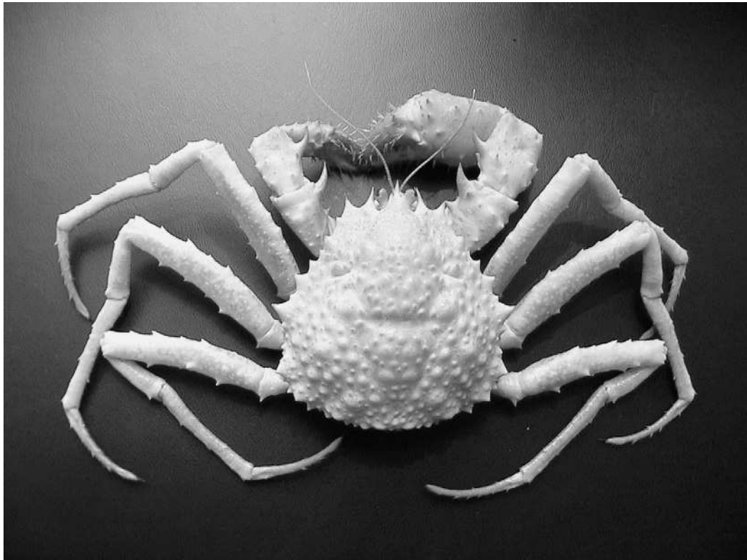
FIG. 1. – Paralomis mendagnai n. sp., holotype, male, 59x60 mm (MNHN-Pg 6408). Dorsal view.