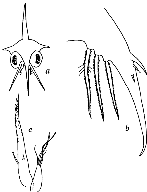
Figure 3. Additional figures of the first zoea of Platypodiella spectabilis from a female collected in the British Virgin Islands. a, frontal view showing relative lengths of lateral and dorsal carapace spines. b, right fork of telson and right side setae, dorsal view. c, antenna (left) and antennule (right).