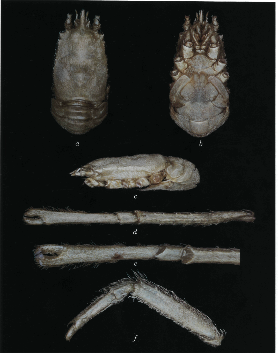
Types (in preservative) from Okinawa Trough, 560-692 m: a , carapace and abdomen, dorsal view; b , same, ventral view; c , same, lateral view; d , left cheliped, dorsal view; e , same, ventral view; f , right 2nd or 3rd pereopod, dorsal view. a-c , holotype, cl 48.4 mm; d-f , detached appendages present in a lot containing all types.