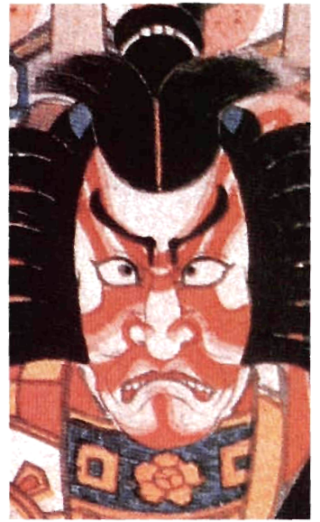
Nineteenth-century woodblock Kabuki print by Utagawa Toyokuni III.