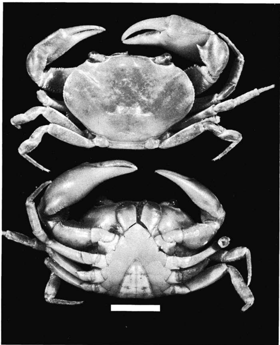
Fig. 1. Brasiliothelphusa tapajoense n. g. n. sp., holotype MZUSP 6550. — Scale = 1 cm.

area depressed, very uneven, muscle scars abundant. Front deflexed, upper border sharp to rounded and granulated. Exorbital corner marked, its tooth tubercle-shaped and not different from the tubercles of the lower orbital border. Anterolateral border with closely set tubercles forming a crest, which is separated by a small